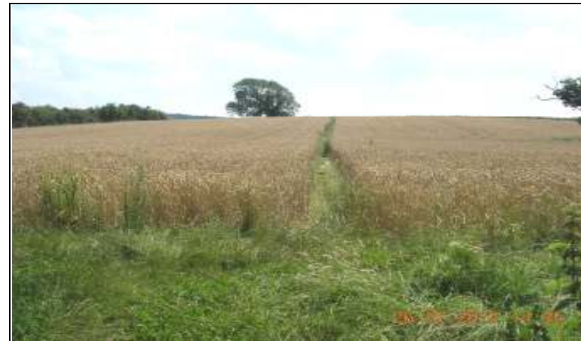
Footpath crossing area 18 Moor Lane

small fields, and invited residents to nominate any areas that were special and evidence their reasons.