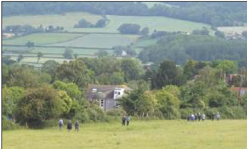
Walkers in Field 1 ‘Church Field’ below St Andrew’s Church